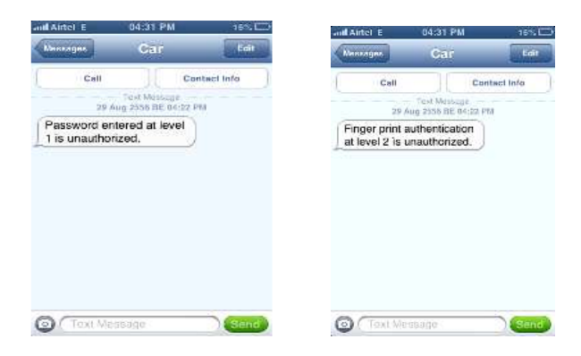
Fig 5: Alert messages to the mobile at level 1 & 2

Otherwise a text message is sent to the owner about "finger print authentication at level2 is unauthorized" as shown in figure5 and at the same time alarm is enabled. In case if a known person to owner desires to use the car, then the person has to undergo the third level of security. In which owner grants access by sending text to the system.