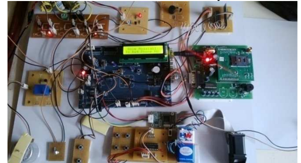
Fig 2: Multi level anti theft security system

In this section we are interfacing microcontroller to coordinate the entire system.